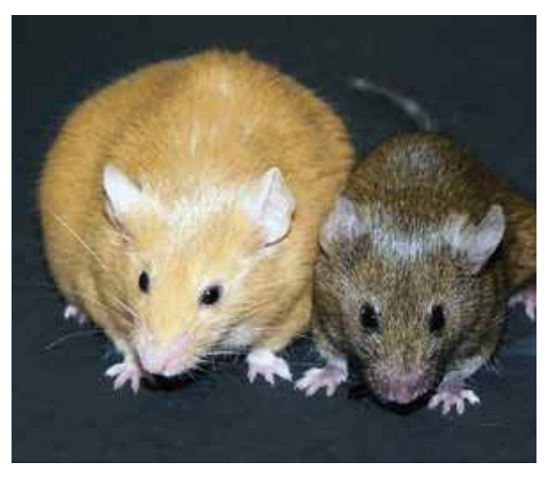
Epigenetic changes make mice that are larger and yellower than their genetically identical counterparts