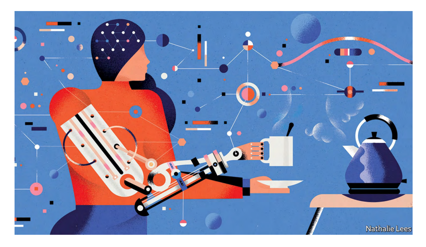
Print edition | Technology Quarterly